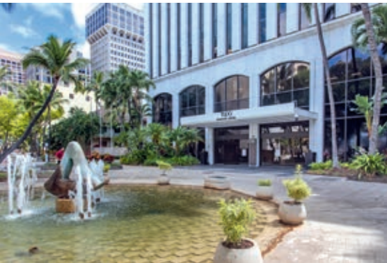
New Home for HCUCC and HCF

We are pleased to announce that the Hawai'i Conference Foundation ("HCF") will be soon be moving to the Topa Financial Center, located at the bottom of Bishop Street across from the Aloha Tower in downtown Honolulu. This will mark a return of the Conference office to downtown Honolulu approximately 75 years after leaving the Mission Memorial Building in the capitol district in 1947.