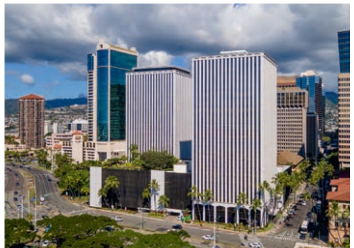
Topa Financial Center